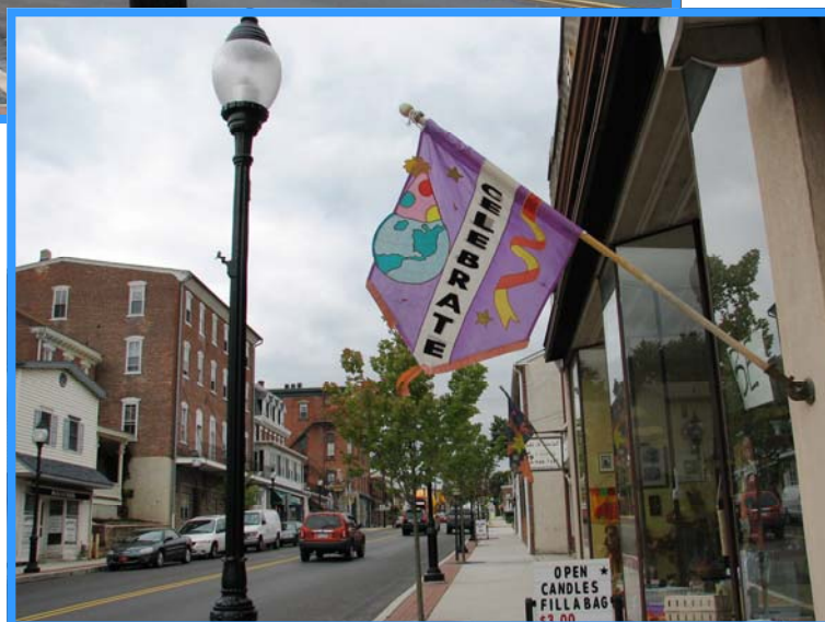
Top - Completed project looking west; Above left - Location sketch; Above right - Looking east along Main Street