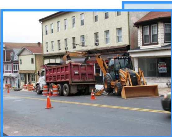
Above - Construction on Phase II between Third Avenue and railroad corridor