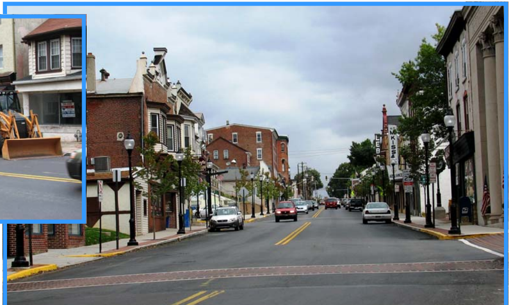
Right - View of completed block