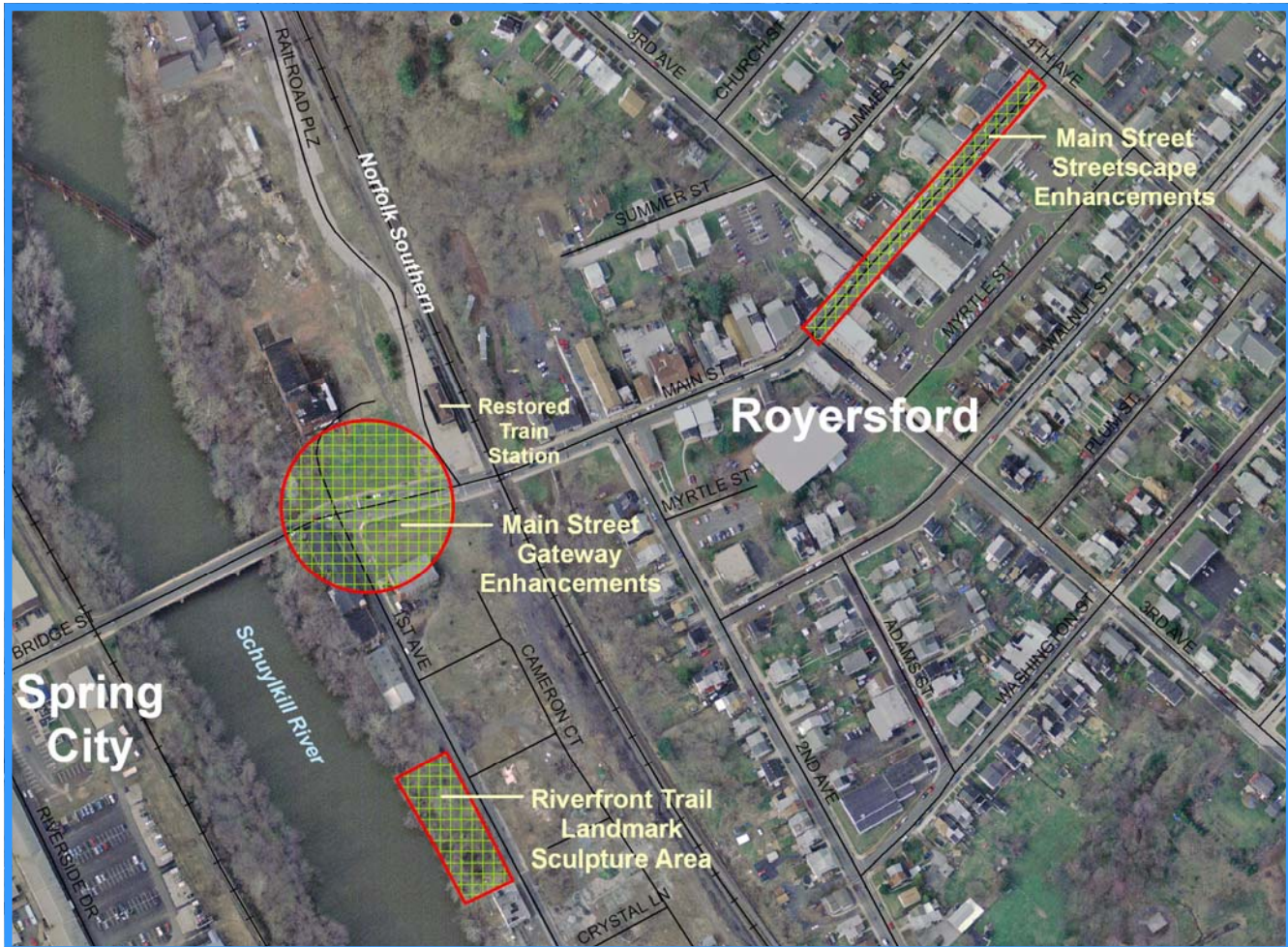
Project Location: First Avenue south of Main Street along Schuylkill River Informal parking along adjoining streets; project not yet implemented