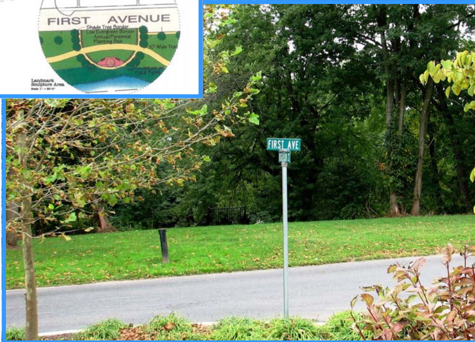
Top Left - Landmark Sculpture Area concept; Top Right - Riverfront site awaiting project initiation