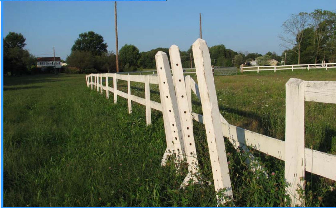
Bottom - Open fields and horse show area