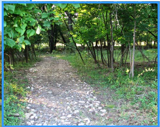
Above - Woodland edge