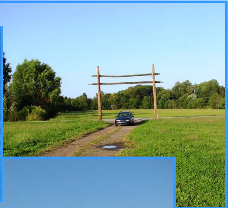
Above Right - Existing driveway from Griffith Road