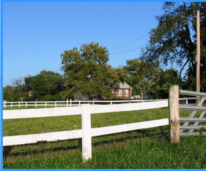
Above Left - View of Community Hall across riding ring