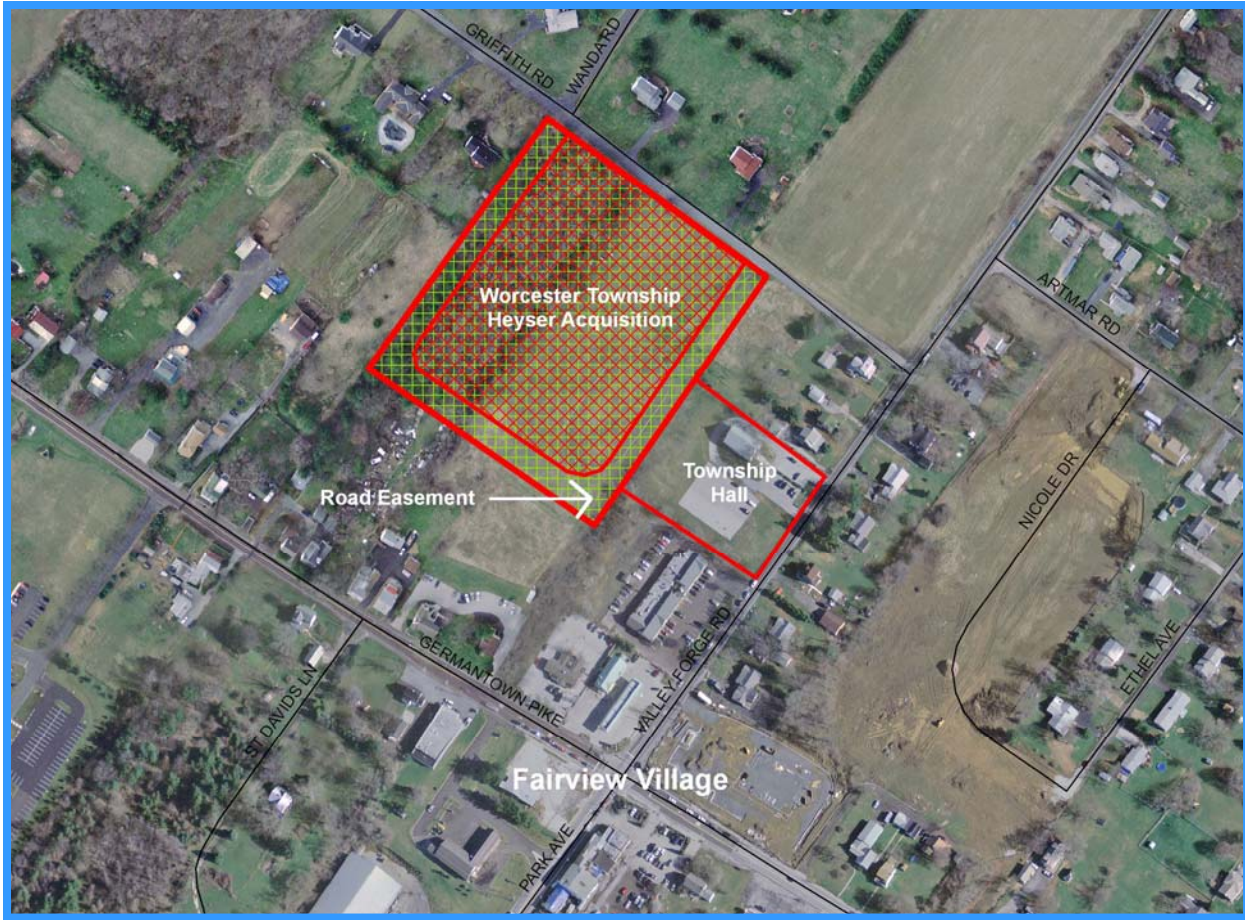
Project location: Griffith Road off Route 363 Fairview Village; located behind Worcester Community Hall Public pedestrian access from Community Hall or Griffith Road; parking at Community Hall