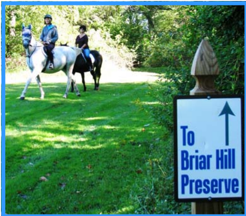
Above - Equestrians return from trails on Briar Hill Preserve