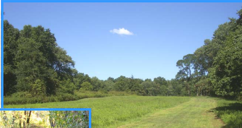
Top - Meadows at Township's Prophecy Creek Park provide edge for Briar Hill woodlands

In Cooperation with Wissahickon Valley Watershed Association