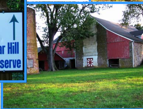
Right - Barn and pond at Prophecy Creek Township Park