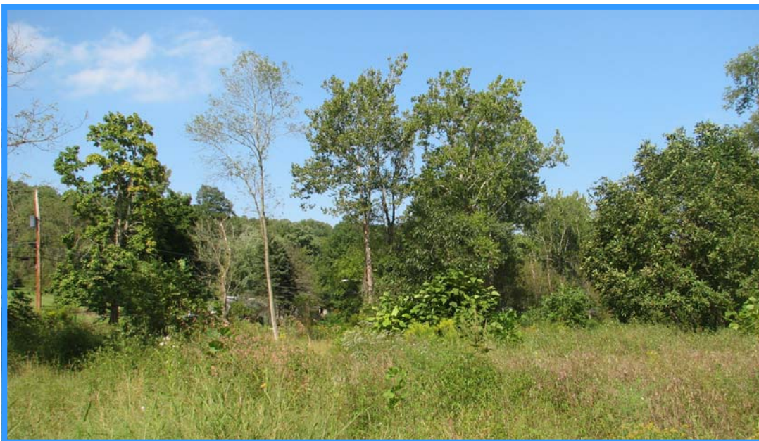
View toward Manatawny Street over Schwab meadow and woodland