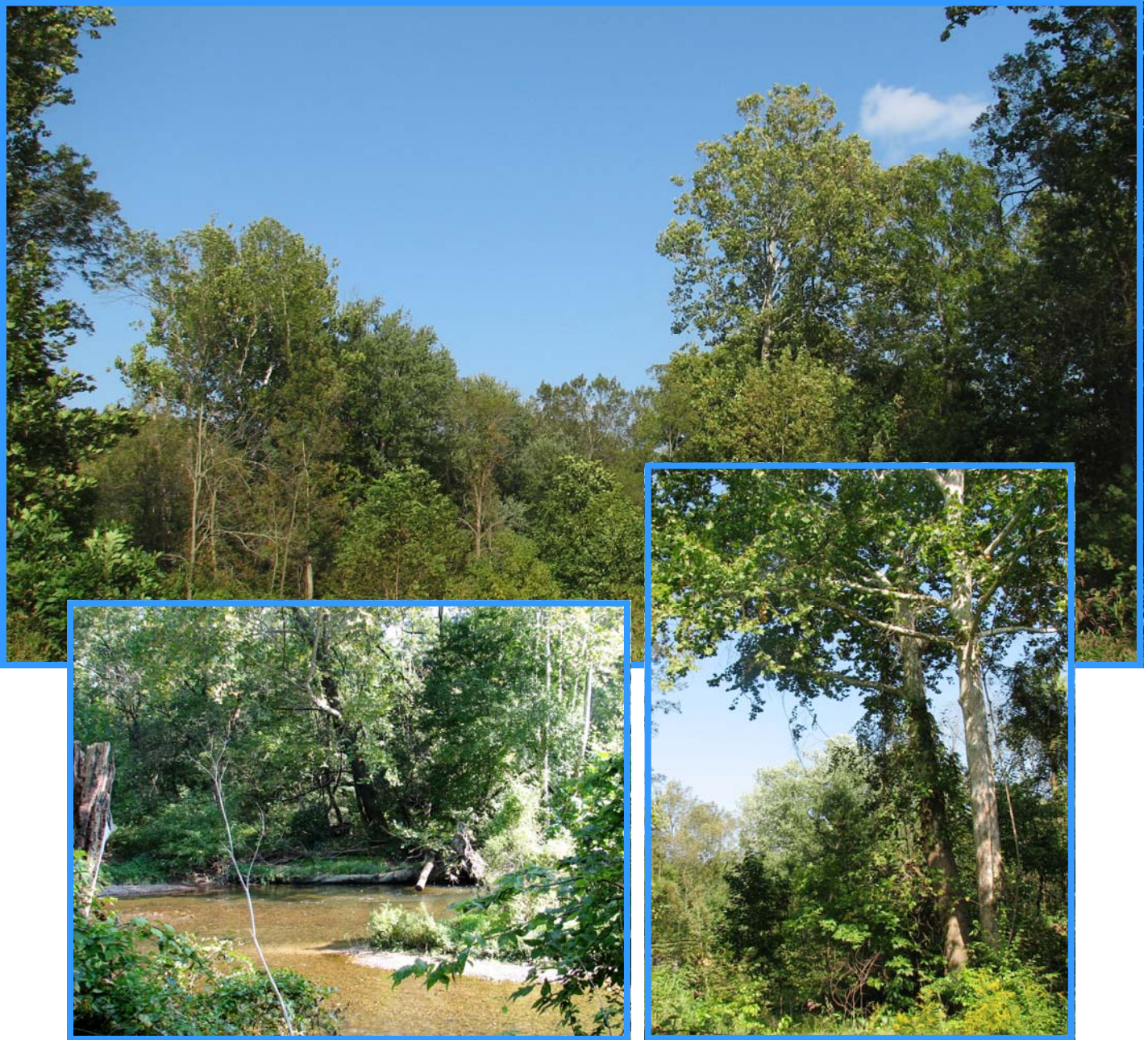
All photos show scenic stream corridor and forest of large flood plain trees on Schwab open space