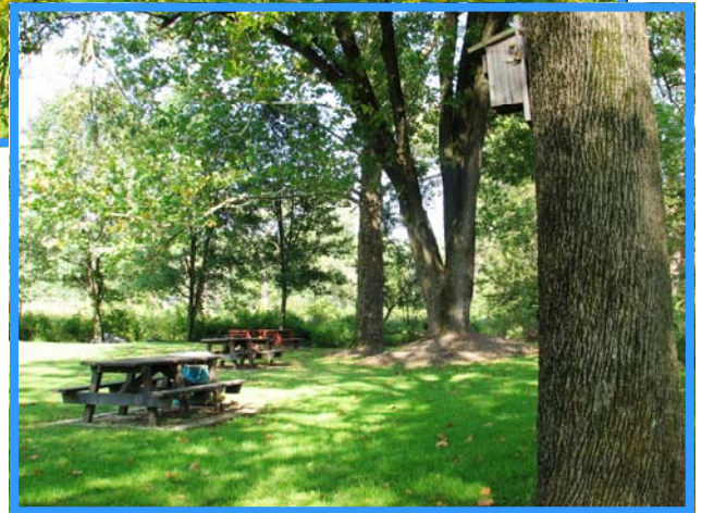
Top - Meadows at McBride parcel; Bottom Left and Right - Manatawny Creek and township park at edge of new open space