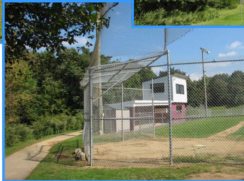
All Photos - Lewiski parcel containing edge of existing township playing fields and woodland for passive recreation