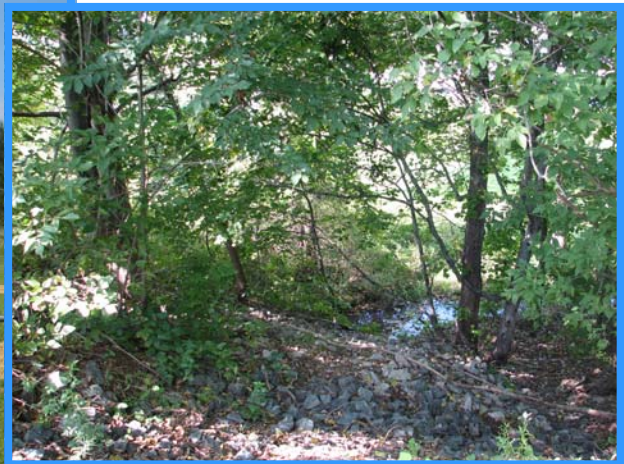
Above - Headwaters of small tributary to Manatawny Creek