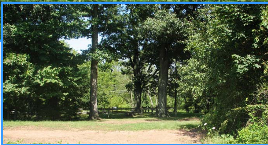
Bottom - View of cemetery from farm road on new open space