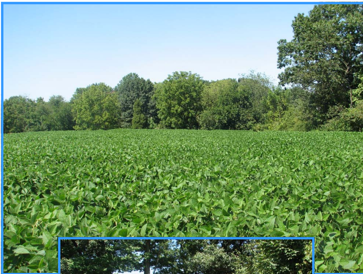
Top - New open space currently sporting soybean crop