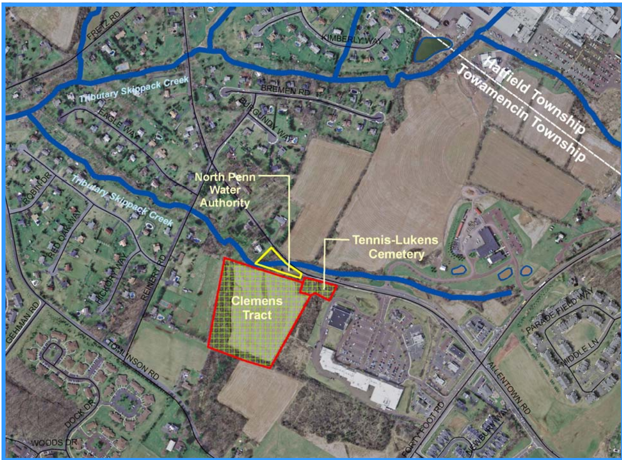
Project Location: Allentown Road between Forty Foot and Reinert Roads Public access is through cemetery or through Water Authority parcel; parking is not yet provided