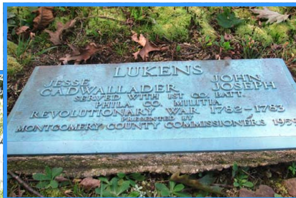
All photos show historic Tennis-Lukens Cemetery