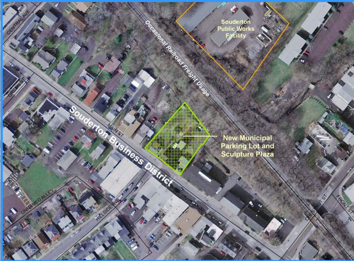
Project Location: Main Street between Chestnut Street and Central Avenue Public access via sidewalk; public parking in municipal lot behind sculpture plaza