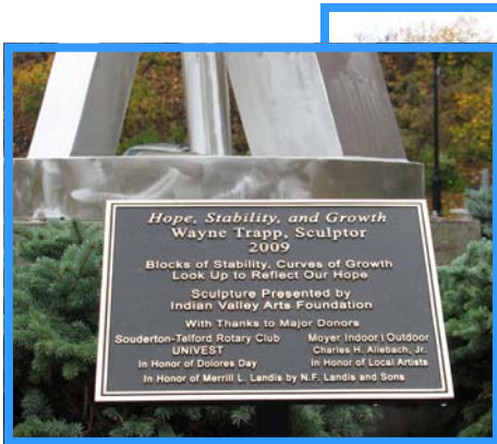
Above - Presentation plaque for sculpture by North Carolina artist