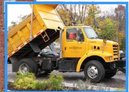
Above - Construction of plaza was overseen and implemented by Souderton Public Works staff