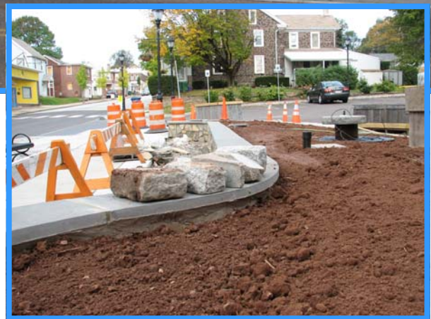
Top - Completed plaza; Above Left and Right - Sitting wall and sculpture garden under construction