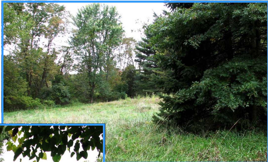
Left and Below - Trees and open meadow on Jones open space