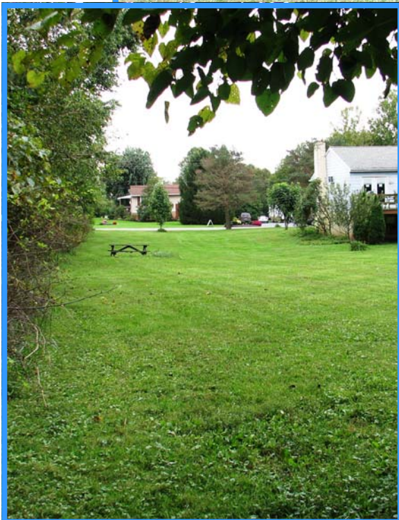
Above - Easement corridor from Wartman Road