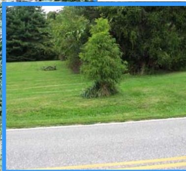
Left and Below - Easement corridor and new open space