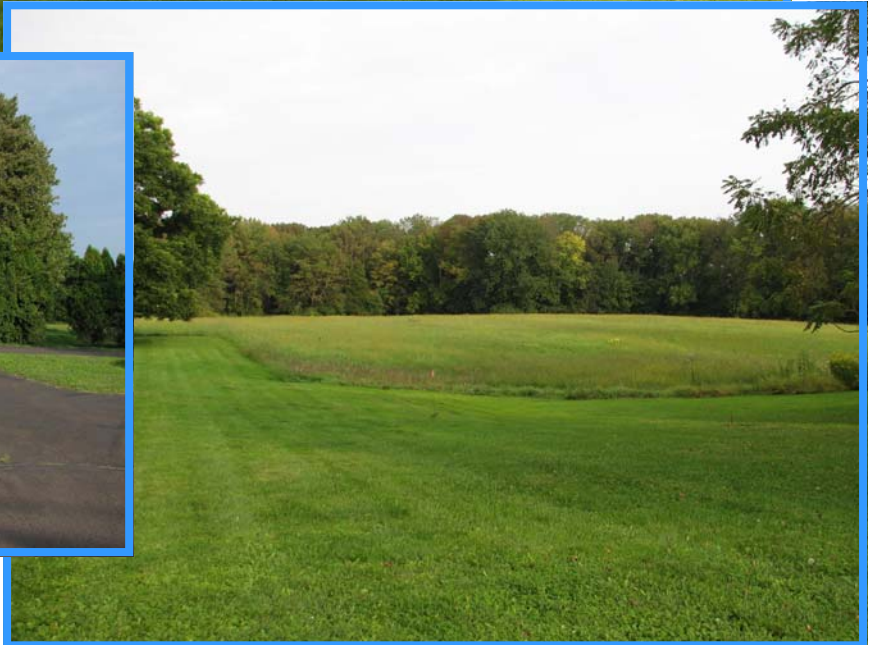
House at front of property, with lawn and fields adjoining previously donated open space