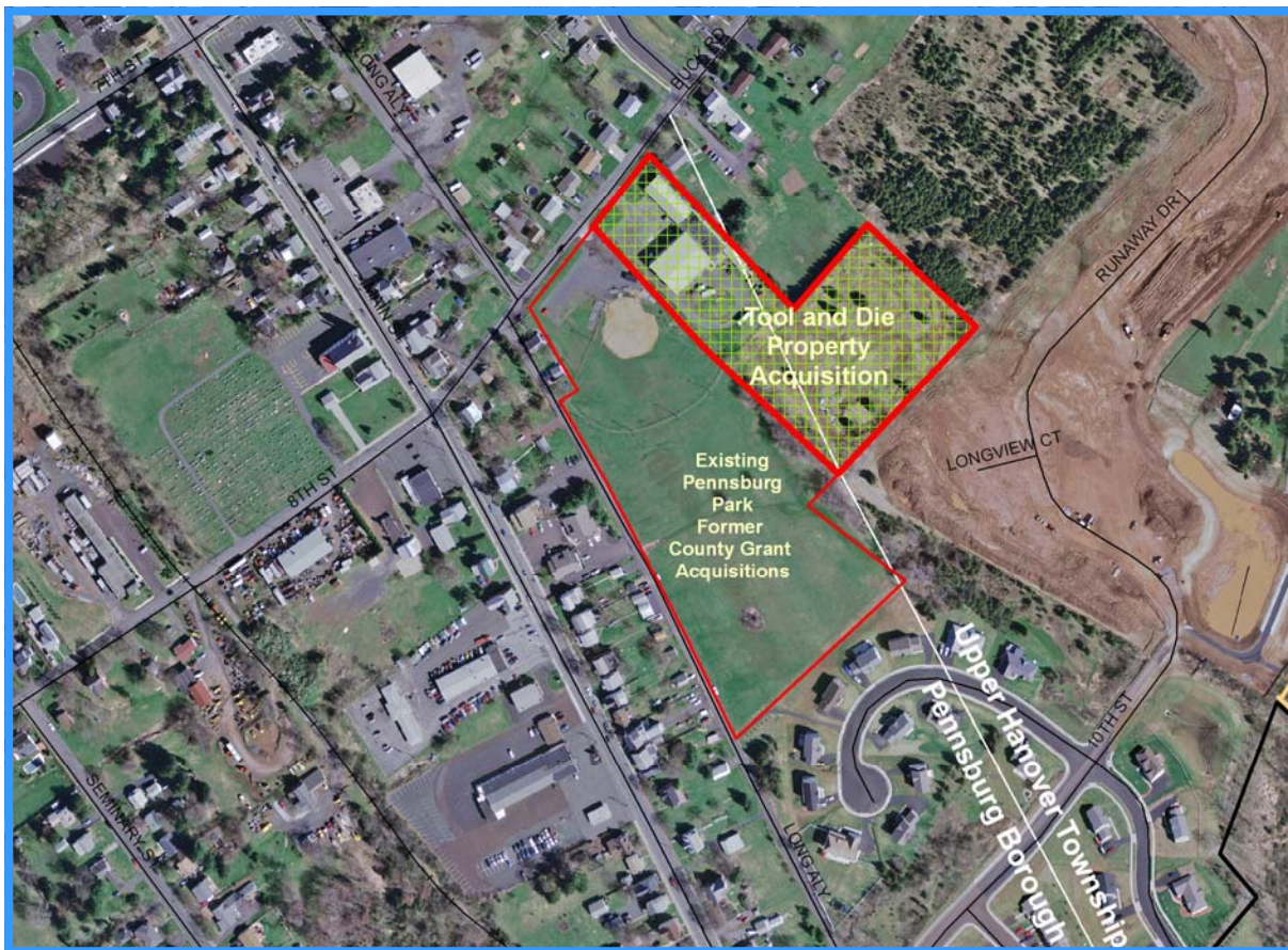
Project Location: 8th Street east of Long Alley; spans Pennsburg/Upper Hanover boundary line Public access and parking via existing Borough park; improvements to Tool and Die parcel are pending