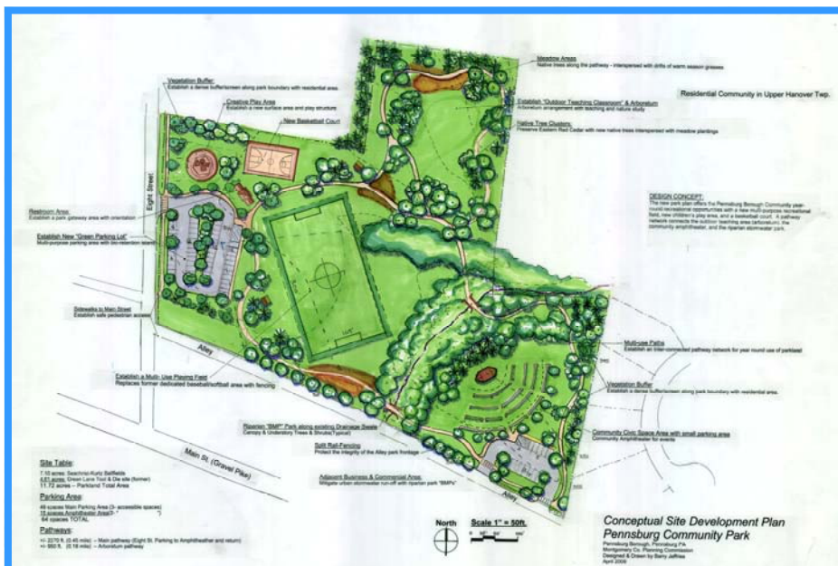
Park master plan including new property acquisition prepared by MCPC June 2009