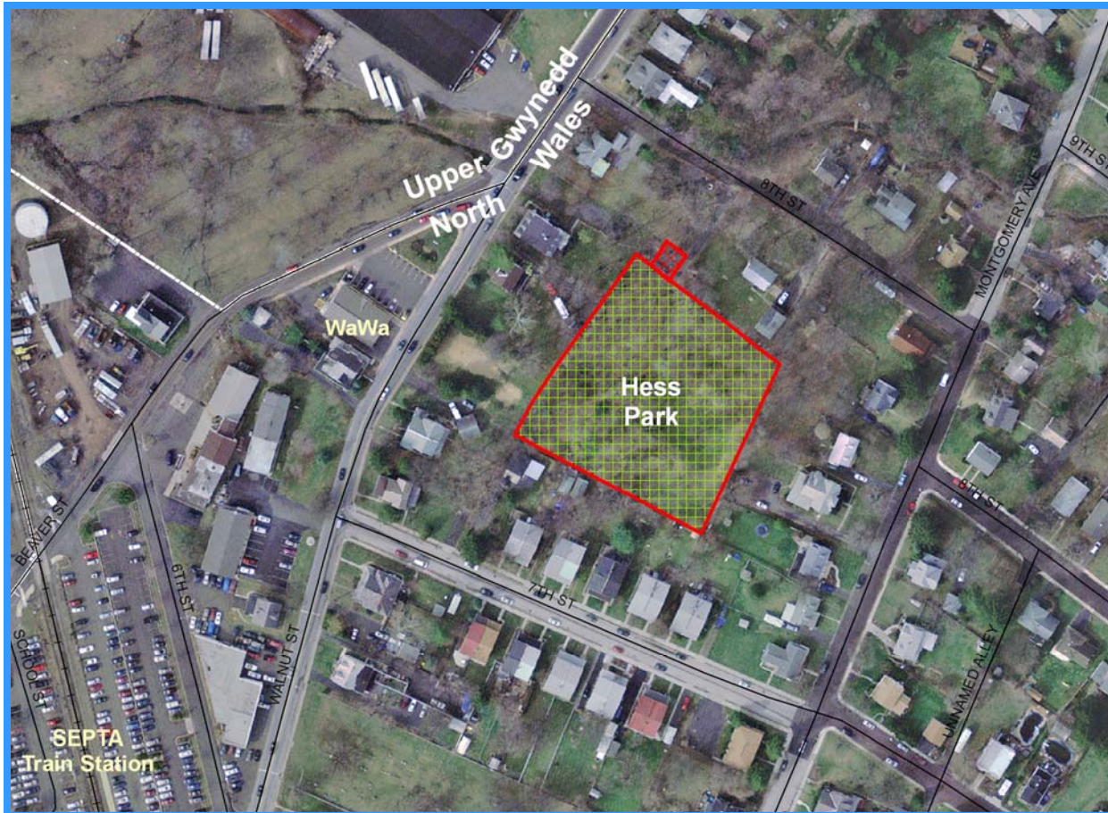
Project Location: Interior of block formed by Walnut, 7th and 8th Streets, and Montgomery Avenue Public access from alley off 8th Street; park has not yet been improved